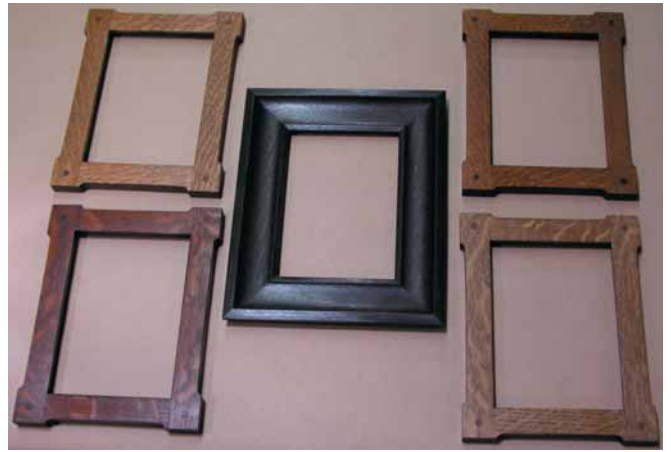
The final tone of a frame can be varied dramatically but effectively. All these quarter-sawn white oak frames have been given different looks through staining and finishing.

There's great satisfaction in wiping off the last of the wax. You should have a frame perfectly keyed in color to the picture and that reveals all the inherent beauty and character of the wood. When it's done right, a good finish protects and enhances a frame just as a frame protects and enhances the picture inside it. ■