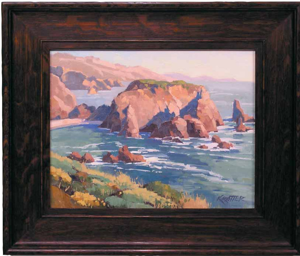
"California Coastline," an oil on canvas by Paul Kratter, is surrounded by a quarter-sawn oak frame that was stained and finished to create a natural look that blends well with the painting.

Frame finishing starts with careful sanding and/or hand-planing to remove all machine marks, to clean up the joints, and to achieve an appropriate degree of smoothness. The character of a particular wood species and the degree of sheen you want are the chief considerations. The coarseness of oak and ash, for example, is part of their appeal and