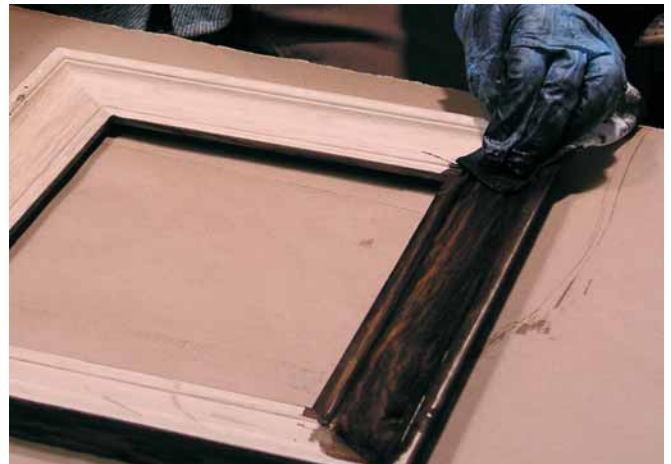
The water-based dye stain is applied with a rag, allowed to soak in, and then rubbed off. The stain should be thin enough so that three or four applications are needed to attain the right tone.