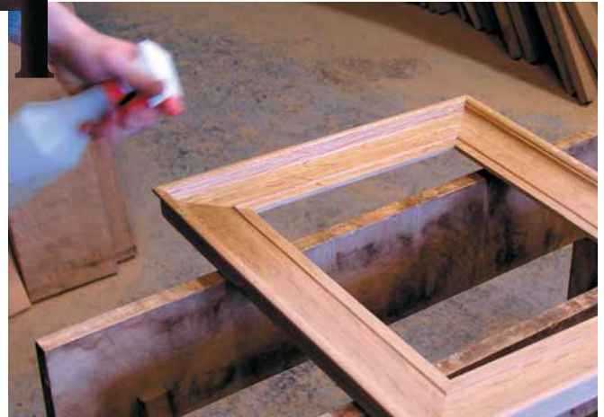
Spraying the raw frame wood with water raises the grain and leads to a smoother surface after a final sanding.

Water dyes require the added finishing step of raising the grain. If you don't do this with clear water before applying the stain, then the stain will raise the grain and you'll