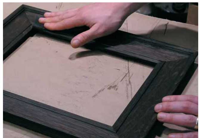
The stained frame is then rubbed down with a scrub pad to help prepare it for the sealing coat.