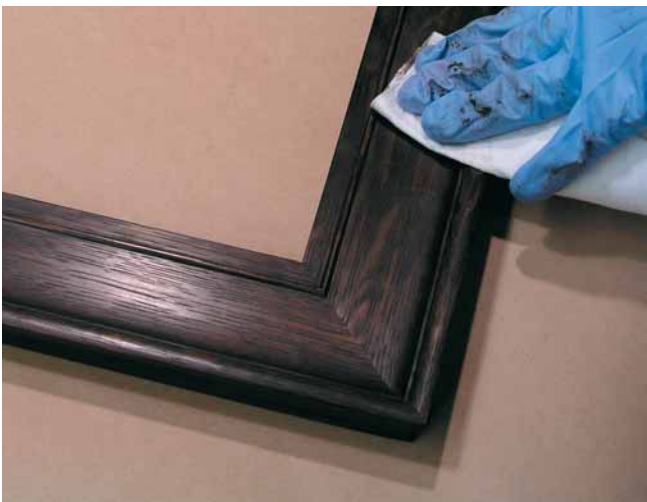
After the varnish top coat has thoroughly dried, it should be rubbed out with a blend of waxes and abrasives.

from dust. A spray booth is optimum for these two finishes, but for most shops a spray booth is not an option, and rub-on varnishes or oils are the best solution. Not only are they penetrating, but because they go on thin they're also more forgiving and less vulnerable to dust. Nevertheless, good ventilation is critical. Always wear a respirator with filters rated for organic vapors. Gloves are the other critical safety item.