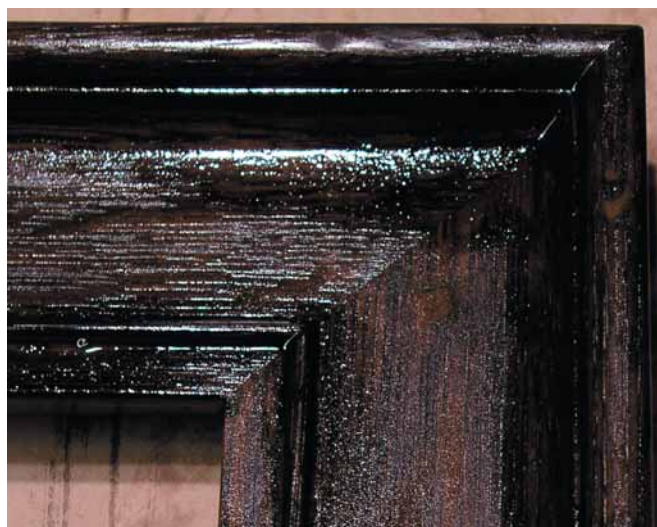
Give the sealer time to be absorbed, and keep applying it until it stops soaking in. Then wipe off the excess with a lint-free rag.

tannin. While we haven't found it to be a problem on oak, we've chosen to play it safe when finishing that wood by sticking with our old-fashioned rub-on varnish.