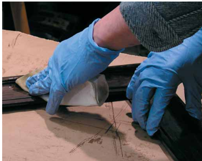
The clear coat sealer is then applied with a lint-free rag.

many clear finishes on the market. The easiest to apply are oils, like Danish oil, the most common brand being Watco. In a quest to find something "greener," we've settled on a German product called Livos. The literature on it says it's problematic when applied to oak and other woods high in